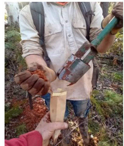
Currawong Resources employees collecting shallow soil samples.